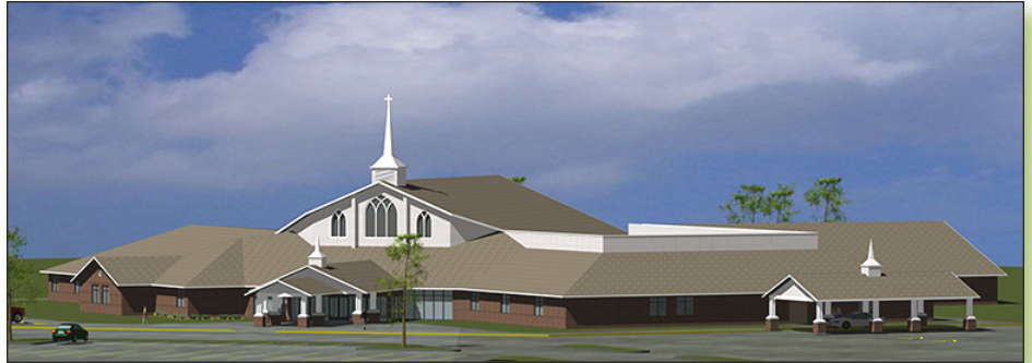
The concept drawing for the new building, above, while modern in appearance and building materials, utilizes design elements that are reminiscent of the older building, below, including the shape of the sanctuary windows and the use of white exterior finishes on the upper facade of the sanctuary

“Max has had some great insights as the committee is considering the plans. He and Kelly have very good people skills and are good at analyzing people’s responses to see how an idea is going over. The integrity of what they’ve done and